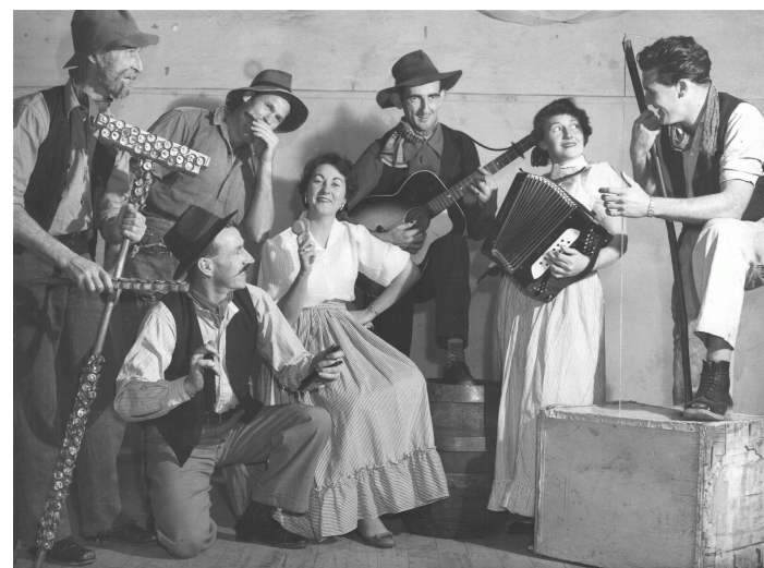
South Coast Bush Band: