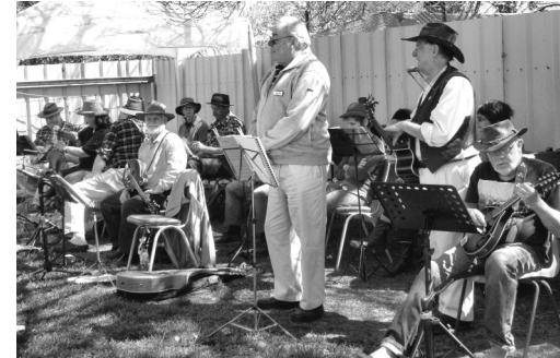
Concert Party at Yeoval