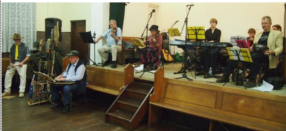
Concert Party playing for the Fundraiser Bushdance at Dulwich Hill.