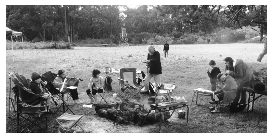
Saplings gathered around the campfire.

The Eureka Rebellion in 1854 was a rebellion of gold miners at Ballarat The Battle of the Eureka Stockade, by which the rebellion is popularly known, was fought between miners and the Colonial forces ('traps') of Australia on 3 De-