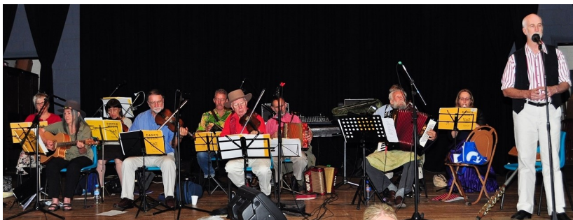
Concert Party at Beecroft (Dec 2013)